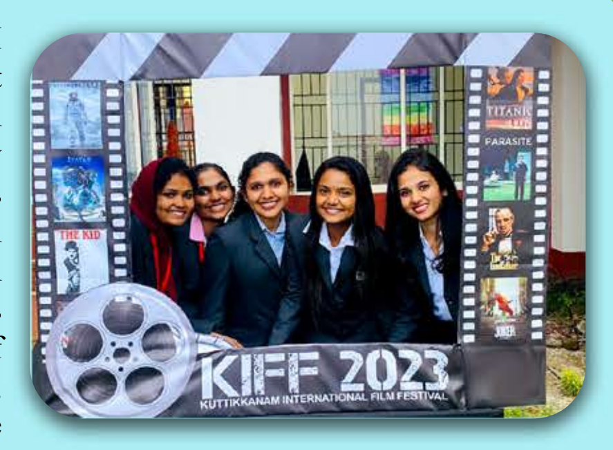
Marian College, Kuttikkanam

On October 8<sup>th</sup> and 9<sup>th</sup> 2023, students from TKM Institute of Management set out for a management fest at Marian Institute of Management in Kuttikanam. The atmosphere buzzed with energy as the students actively participated in various events, showcasing their talents and knowledge in the field of management. The fest at Marian Institute provided a great opportunity for students to learn, collaborate, and enjoy the vibrant spirit of competition. It was a delightful experience, fostering a sense of camaraderie and leaving the students with cherished memories from the event.