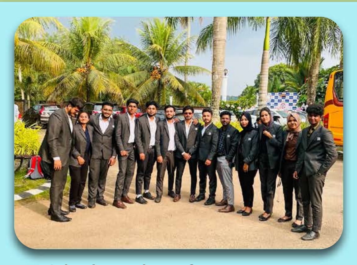
Saintgits Institute of Management

Participating in college fests offers more than just leisure; it represents a holistic learning endeavor. These events provide students with opportunities for personal growth, skill enhancement, and fostering a sense of community and cultural appreciation. As our students actively engage in these experiences, they contribute to the vibrancy of our college community while shaping a well-rounded educational journey.