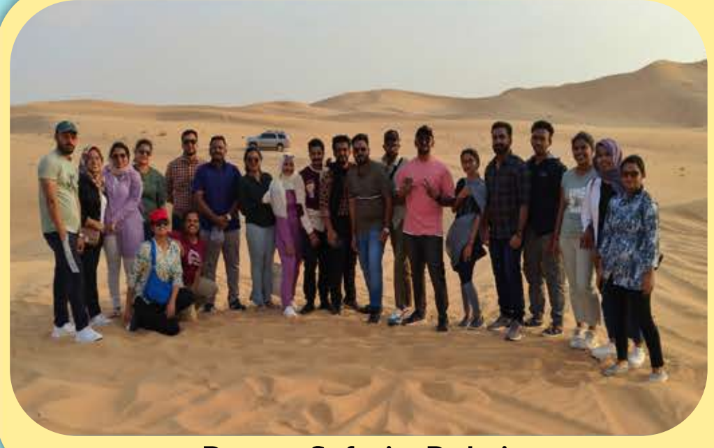
Desert Safari - Dubai