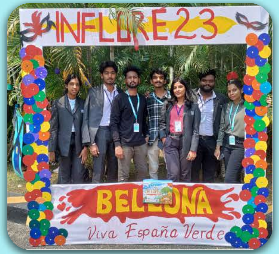
Rajagiri Institute of Management

On October 2023, students from TKM Institute of Kochi's Management ventured to Rajagiri Institute of Management for an enriching management fest experience. The two-day event brimmed with enthusiasm and camaraderie as students immersed themselves in a plethora of activities and competitions. Serving as a platform to showcase their management prowess, the fest facilitated meaningful interactions with peers from diverse institutes, fostering a spirit of collaboration and mutual learning. Beyond its educational value, the trip provided students with an opportunity to revel in their passion for management, creating cherished memories along the way.