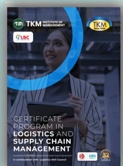
Certification Program in Logistics and Supply Chain