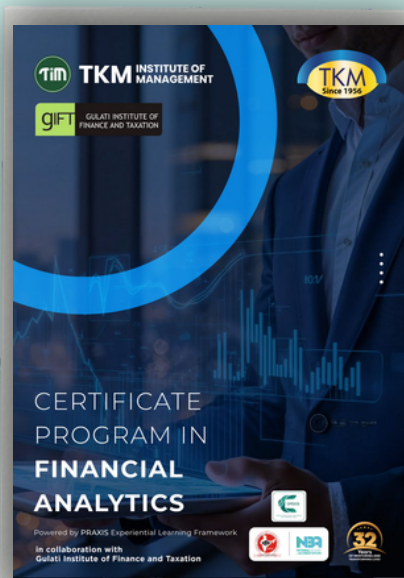
Certification Program in Financial Analytics

Industry-aligned certification programs designed by TIM to shape future-ready professionals