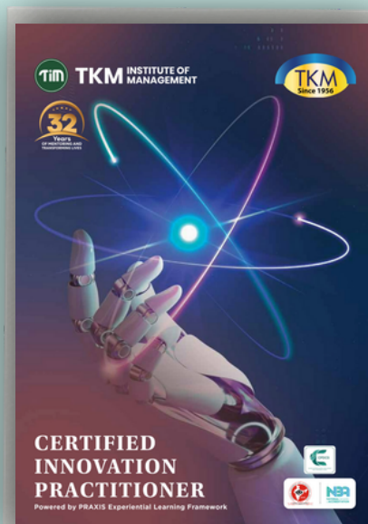
Certified Innovation Practitioner