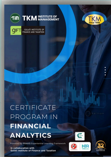
Certification Program in Financial Analytics

Industry-aligned certification programs designed by TIM to shape future-ready professionals