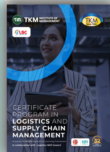
Certification Program in Logistics and Supply Chain