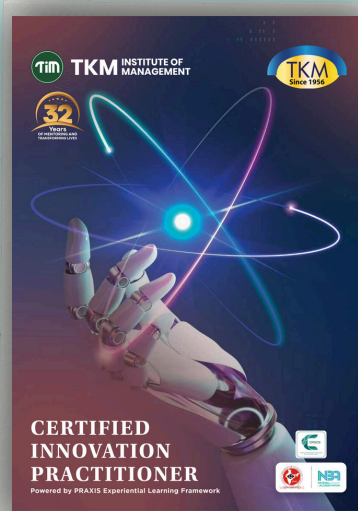
Certified Innovation Practitioner