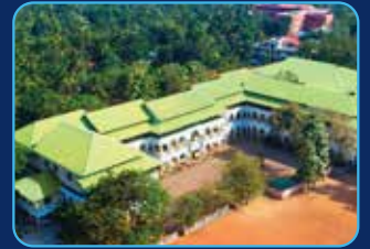
TKM Centenary Public School- 1997