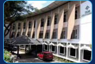
TKM School of Architecture- 2014