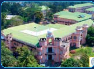
TKM College of Engineering - 1958