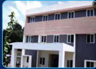
TKM School of Information & IT- 2000