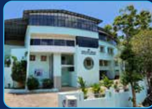
TKM Institute of Management- 1995