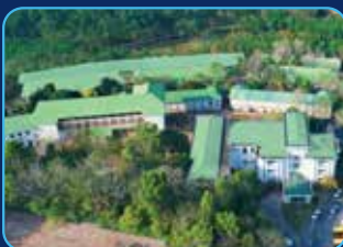
TKM Institute of Technology- 2002