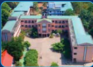
TKM Higher Secondary School- 2000